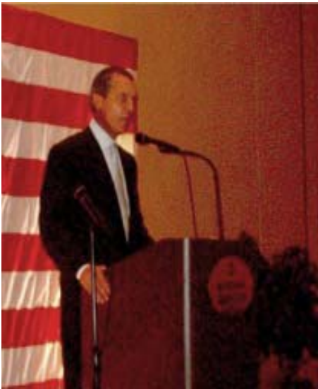
LT. GOVERNOR DAVID DEWHURST DELIVERS THE KEYNOTE ADDRESS