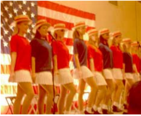
THE DANCE THEATER OF ARLINGTON PERFORMS "FAVORITE SON."

The Arlington Republican Club now has 30 successful years as a viable political entity for the citizens of Arlington and Tarrant County. Started in 1975, thousands have benefited from the work, education, and opportunities provided by ARC. We are still hard at work providing the information and opportunity for good government in Arlington, Tarrant County, and the State of Texas.