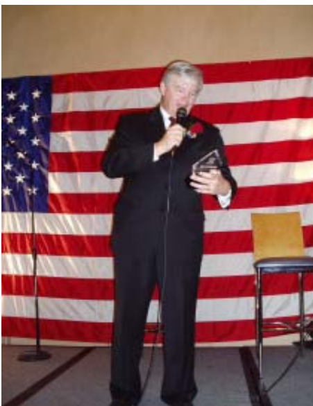
CONGRESSMAN JOE BARTON PRESENTS THE HOMETOWN REPUBLICAN LEADER AWARDS.