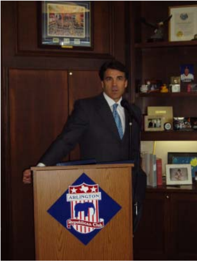
GOVERNOR RICK PERRY SPEAKS TO THE ARC ON NOVEMBER 16, 2005